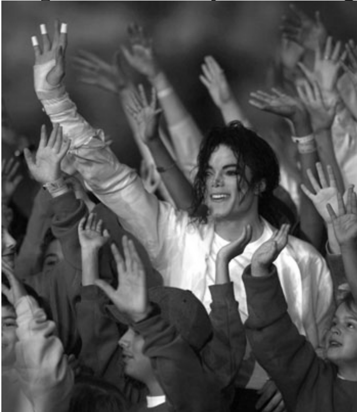
Michael Jackson in Live Appearance