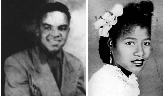
Joseph and Katherine Jackson