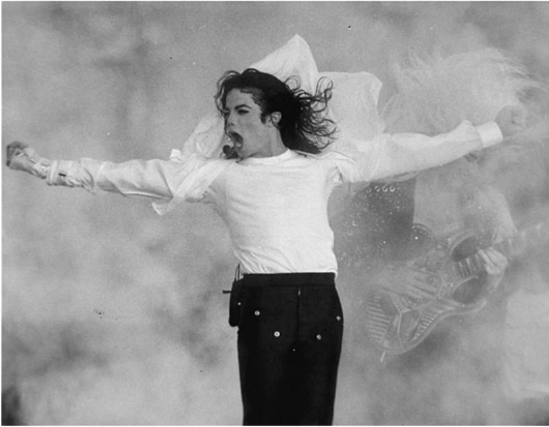
Michael Jackson in Live Appearance